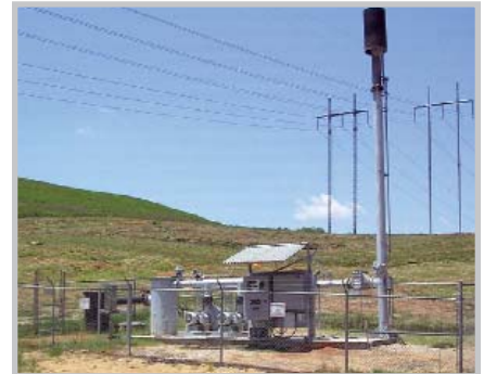
WESTON's wireless remote monitoring system upgraded flare station capabilities, and provided real-time data capture and alarm notification.

DeKalb County, in metropolitan Atlanta, is Georgia's second largest county, serving a community of over 700,000 residents and 8,000 businesses. The DeKalb County Sanitation Division services this community and manages over 750,000 tons of waste per year including municipal solid waste, yard debris, and construction and demolition waste. Seminole Road Landfill, the county's solid waste disposal facility, is a 1,150-acre landfill with Subtitle D lined units, non-Subtitle D unlined units, and closed units. The facility includes groundwater and methane monitoring systems and an active landfill gas collection and control system (GCCS).