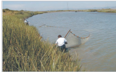
Napa Salt Ponds Biological Surveys, California Department of Fish and Game