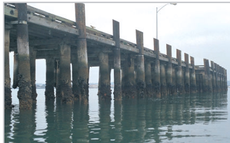
Marine Resources Evaluation, North Embarcadero Alliance Visionary Plan Master EIR, San Diego