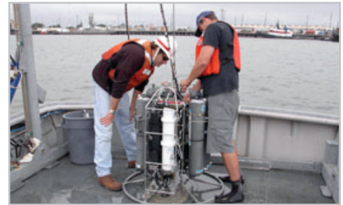
Water Quality Monitoring for the 50-Foot Deepening Project, Port of Oakland