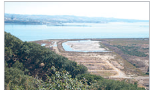
Port Facility and Dredge Ponds Redevelopment, Mare Island, CA