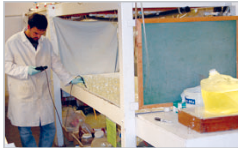
Dredged Materials Sampling and Testing, U.S. Army Corps of Engineers, San Francisco District