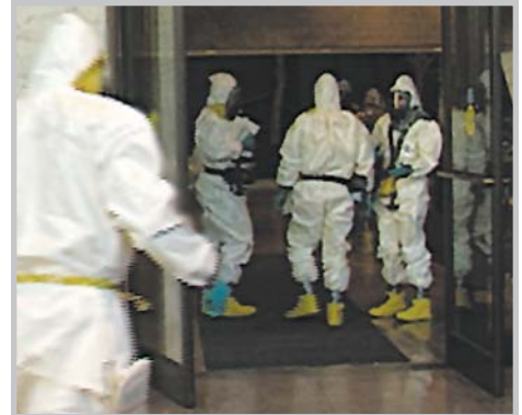
WESTON personnel enter the Hart Senate Building during the anthrax cleanup.

Weston Solutions, Inc. (WESTON®) has been involved in homeland security since 1996 when it began assisting the federal government in preparing for high profile events, building on a 20-year history of responding to national emergencies. WESTON responded to both the World Trade Center tragedy and the U.S. Postal Service and Senate anthrax attacks, and was the lead environmental contractor for the Space Shuttle Columbia recovery efforts. WESTON is providing homeland security planning, system design/build, and response support across the nation. Through it all we have ensured the timely and appropriate use of proven technologies to accomplish our missions.