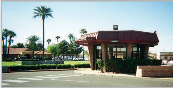
WESTON prepared an Environmental Assessment for road improvements at Luke AFB, Arizona, for a project that would allow Luke AFB to meet Anti-Terrorism Force Protection (ATFP) Standards.