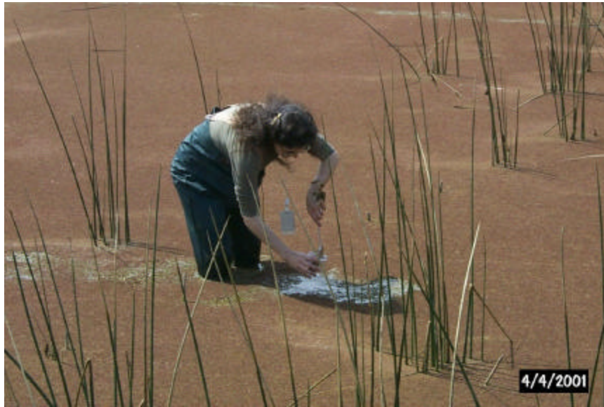
Figure 7 – Sediment Sampling for Monitoring

Long-term monitoring relative to performance and general observations is relatively simple and straightforward. Measuring the target constituents in the influent to the constructed wetlands and comparing those results with measurements from the constructed wetlands effluent will determine performance of the constructed wetlands in terms of treatment of the targeted constituents and achieving the objective. Long-term monitoring of the redox will provide an early warning if the biogeochemistry begins to change and adjustments are needed to maintain performance.