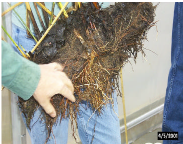
Figure 2 – Root Zone of Mature Bulrush Plant

Indigenous vegetation was surveyed and evaluated for ability to meet these criteria and a bulrush ( Scirpus sp.) was selected. The role of Scirpus in remediation of Cu, Pb, and Zn has been established in previous studies (Hawkins et al. 1997; Gillespie et al. 2000) with objectives consistent with those for the A-01 effluent outfall. In addition to providing necessary redox conditions for sequestering metals in the hydrosol, vegetation density at full maturity will influence the wetlands' ability to promote sedimentation of suspended solids and associated BOD. Figure 2 shows the dense root zone of a mature giant bulrush ( Scirpus Californicus ) plant.